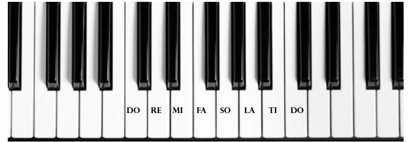
KEYBOARD SCALE 2 :